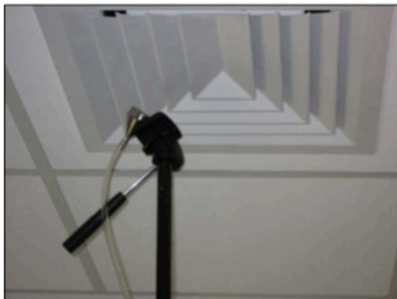
Close up of location #2