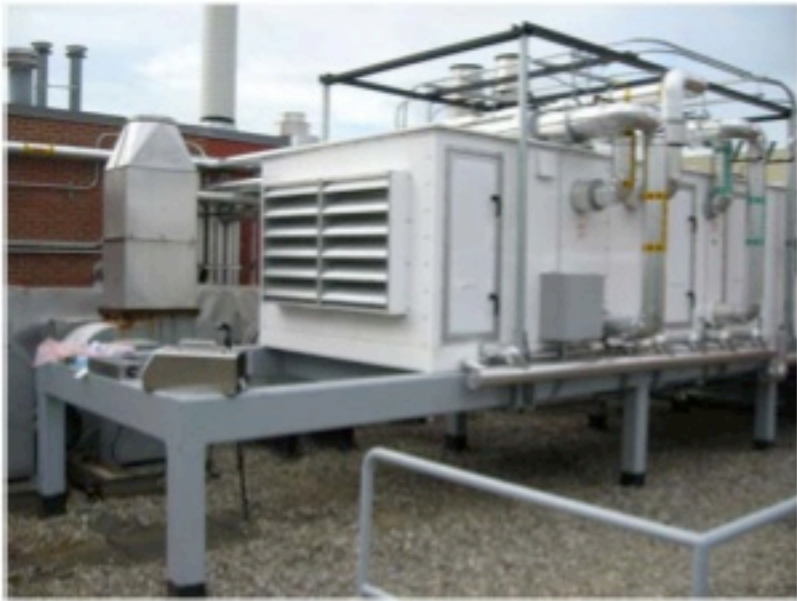
Roof Top "CleanPaK" Air Handler