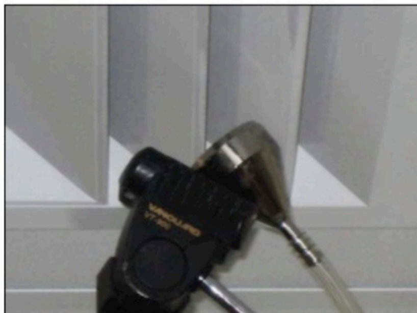
Close up of location #1