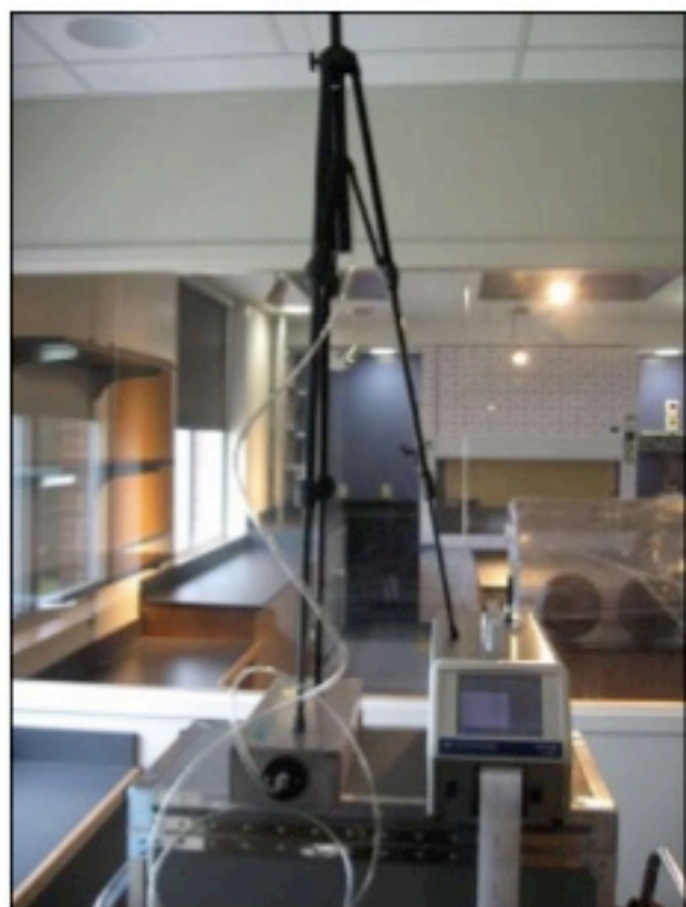
Lab "write up area" supply diffuser outlet test location #2