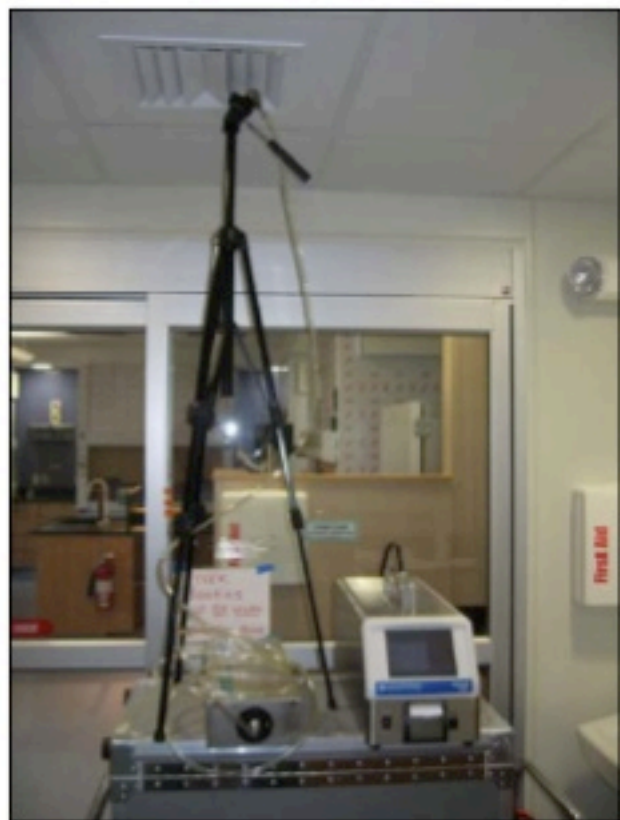
Lab "airlock" supply diffuser outlet test location #1