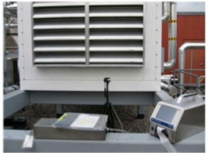
Roof Top AHU Location #2 (right side of intake)