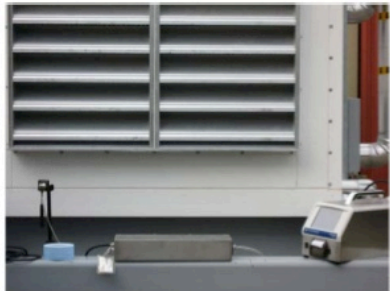
View of probe on tripod, diluter and Laser Particle Counter used during data acquisition