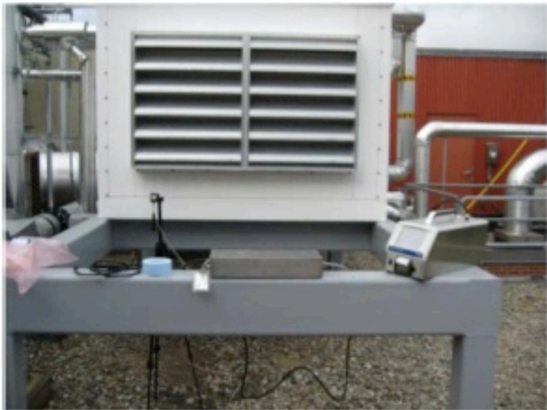
Roof Top AHU Location #1 (Left side of intake)