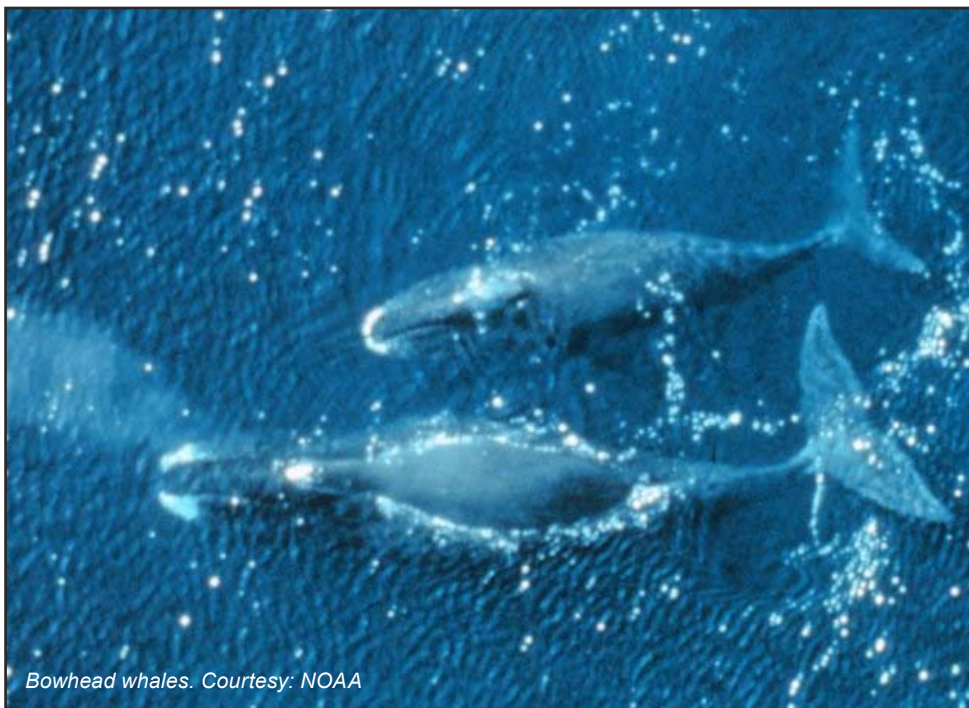
Bowhead whales.

field notes is published monthly. Our thanks to those who provide news updates, photos, story ideas, and encouragement. Please send feedback and suggestions to kip@polarfield.com