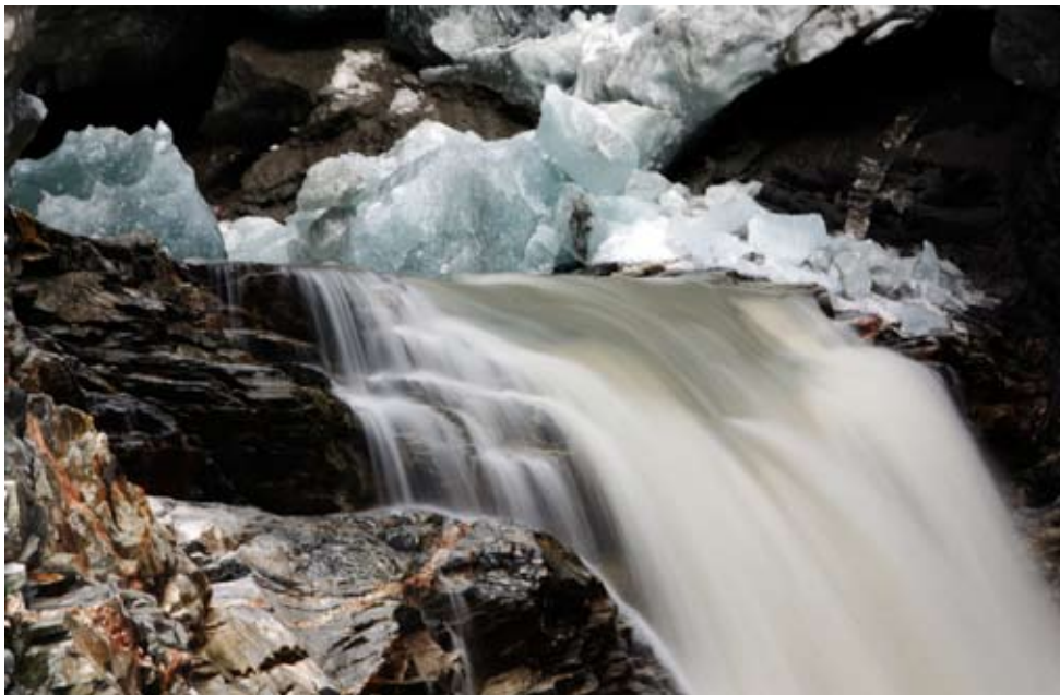
From the ice sheet: Glacial meltwater swells a stream near Kangerlussuaq.