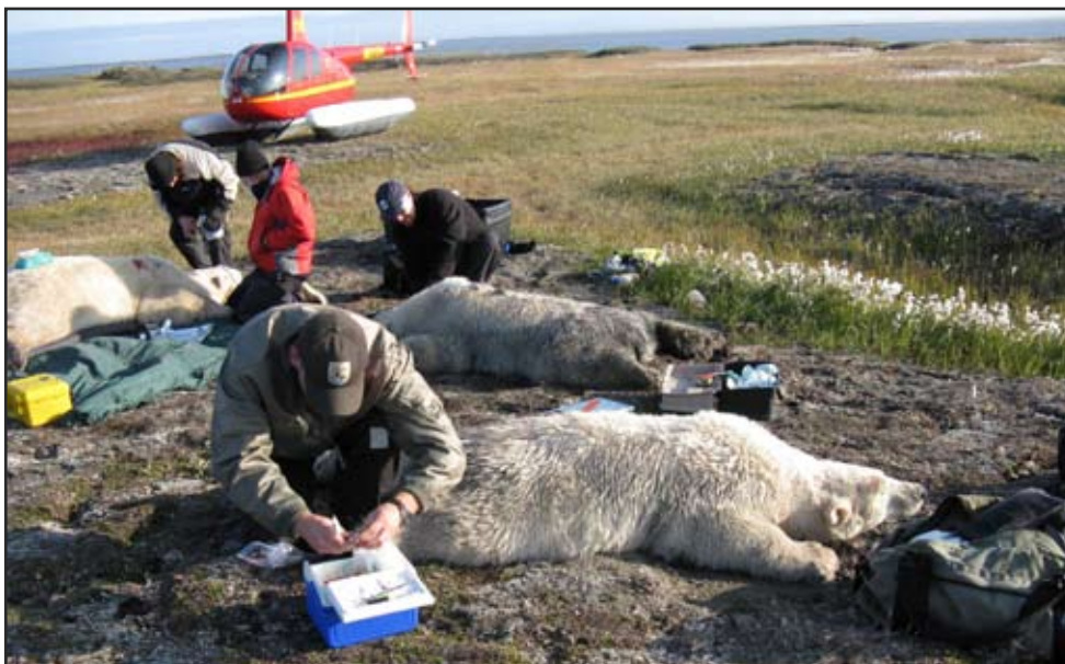
Scientists quickly take samples from anesthetized bears.

portunity the fire presents and the work to be done here .