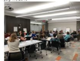
WRCEFS Annual Meeting