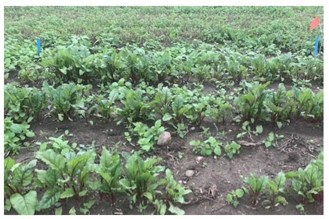
Field trials and crop growth.

Application rate: 30 lbs N ac<sup>-1</sup> Planting date: 12-Aug Harvest date: 12-Oct Crop: Beets (var Eagle) Soil Type: Benson rocky silt loam Row spacing: 40″ between rows