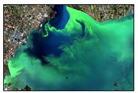
Algal bloom in Lake Erie, 2017.

Currently, phosphorus usage efficiency at farms is less than 20%, with the rest ending up in wastewater and surface waters. The waste to value technology developed by GSR Solutions can be used as a nutrient treatment system to remove excessive nutrients from both the digested or non-digested waste effluent streams and convert them into specialized microbial biomass, which prevents them from being flushed back out into rivers and lakes. Byproducts of this technology can be repurposed for fertilizers, food, or biofuel. Recycling nutrients through the process returns nutrients to crops, improves water quality, and reduces nutrient loss by "closing the loop".