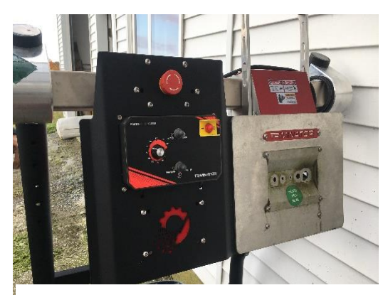
Image 2. Centurion Pro Gladiator Trimmer (Maple Ridge, BC, Canada).

Yield data and stand characteristics were analyzed using mixed model analysis using the mixed procedure of SAS (SAS Institute, 1999). Replications within the trial were treated as random effects,