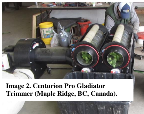
Image 2. Centurion Pro Gladiator Trimmer (Maple Ridge, BC, Canada).

The drying trial began at harvest, when Lifter hemp plants were debudded, weighed, and placed in two dryers, one with an 80° F temperature treatment and one with a 105° F treatment. Samples dried at ambient temperatures were placed on similar hardware cloth trays and placed in two separate rooms. Locations for each drying temperature were further differentiated by the use of a dehumidifier and lack of dehumidifier, with all treatments receiving airflow through use of a fan. Within dryers, two middle shelves were filled with equal amounts of hemp flower where each tray section was a replicate. Fans, driers and dehumidifiers remained on throughout the duration of the drying period. Samples dried at 105° F were started on 5-Oct and were removed from dryers on the morning of 6-Oct for both the dehumidifier and no-dehumidifier treatments. Samples dried at 80° F began drying on 6-Oct and were pulled on the afternoon of 7-Oct (dehumidifier) and morning of 8-Oct (no dehumidifier). Ambient samples began drying on 8-Oct and were pulled on afternoon of 12-Oct (dehumidifier) and afternoon of 14-Oct (no dehumidifier). Samples were monitored for temperature and relative humidity throughout the drying period however data were lost through technical errors.