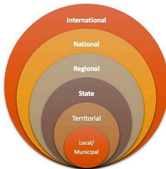
Figure 1: We will focus on the New England region and engage with a multi-scalar governance framework to examine the dynamic relationship between actors, institutions, systems, and policies across multiple scales of governance. This conceptualization will be further developed and refined through this project.

The UVM Institute for Agroecology is recruiting for a postdoctoral position to work on a participatory action research project focusing on how regional governance can support more just transitions in food systems in New England. The postdoc, working with the Institute for Agroecology and Food Solutions New England , will lead a project to study historic and current regional governance initiatives and examine the complementarity of two frameworks – the Right to Food (RtF) and Agroecology (AE) – in the governance of food system transformation (Figure 1).