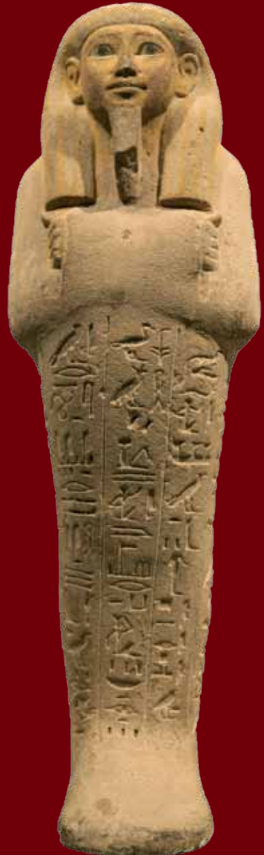
Shawabti of Nehy, Viceroy of Kush, Dynasty 18, 1479-1425 BCE Sandstone. Gift of George Perkins Marsh 1910.6.1