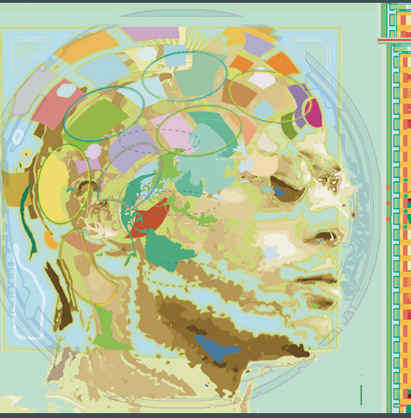
W. David Powell, Contemporary Celebrity Phrenology for the People , 2007 (detail). Digital Print.

As a landscape photographer, Light explores the traditional subjects of the beautiful, the sublime, and the awe-inspiring force of nature. The man-made nuclear landscape, as he makes clear, surpasses nature in its violence. These images range from stunning, abstract impressions of fire and energy to portrayals of people watching the blasts who seem blithely unaware of the destructive power they are witnessing. It is this dichotomy of beauty and horror, attraction and repulsion, violence and seduction that make this collection of images so compelling.