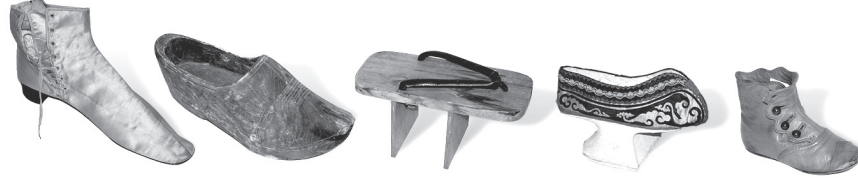
A sampling of shoes from the Fleming Museum's permanent collection.

For the most up-to-date information on our fall schedule, please visit us at www.flemingmuseum.org or call 656-2090