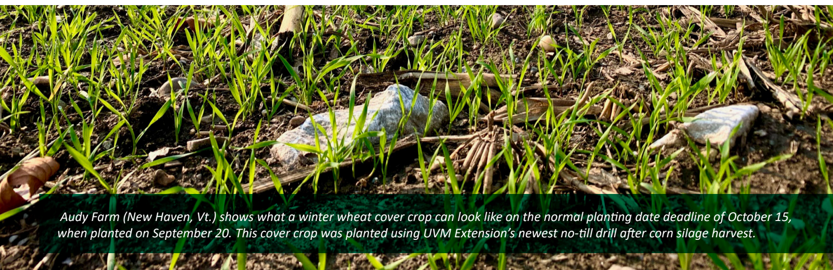
Audy Farm (New Haven, Vt.) shows what a winter wheat cover crop can look like on the normal planting date deadline of October 15, when planted on September 20. This cover crop was planted using UVM Extension’s newest no-till drill after corn silage harvest.

As I often say, we are no strangers to change in agriculture. If we resisted change, we wouldn’t be in the business of farming. So, let’s take a moment to embrace the changes that will propel us forward in the future and learn as many lessons as we can from surviving 2020.