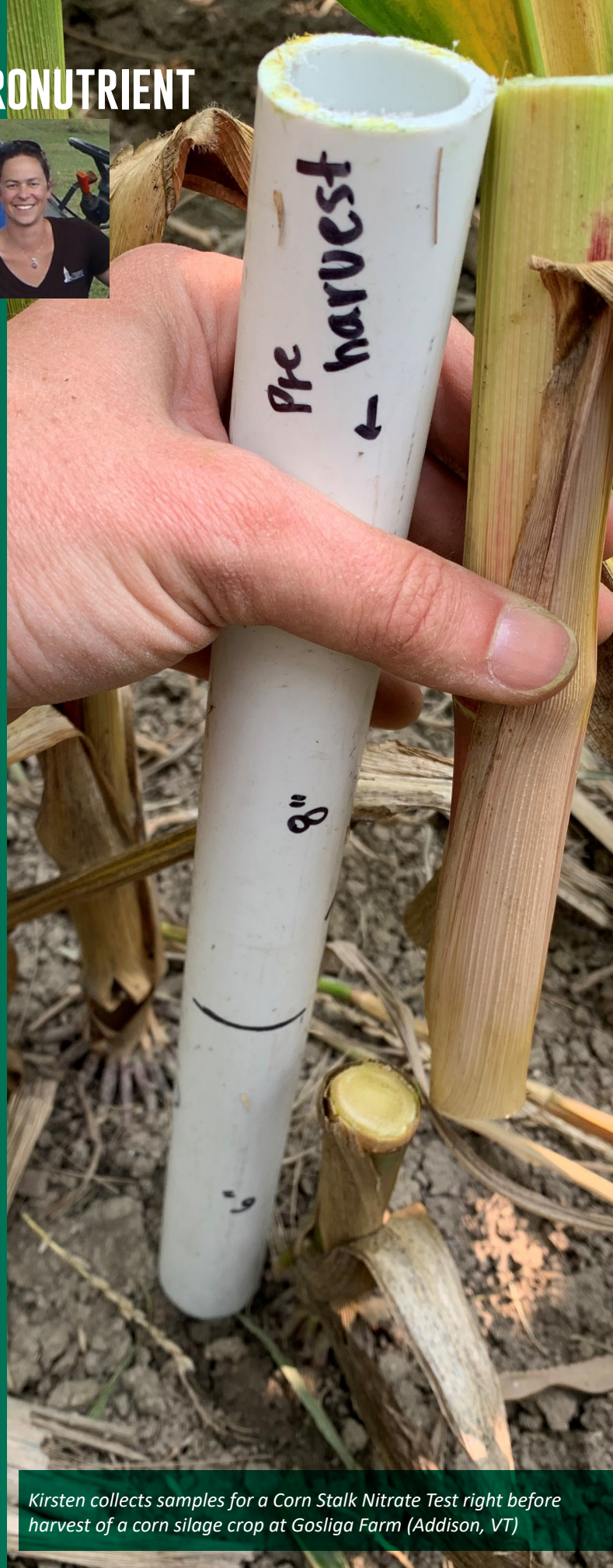
Kirsten collects samples for a Corn Stalk Nitrate Test right before harvest of a corn silage crop at Gosliga Farm (Addison, VT)