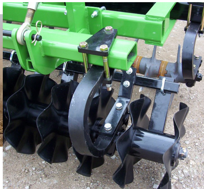
(right) Aerator machine (Gen-Til) equipped with coulters for vertical tillage.