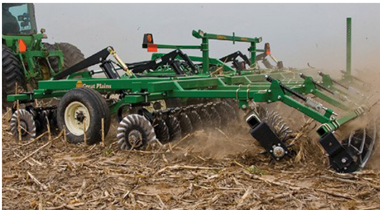
(above) Vertical tillage implement (Great Plains) with straight cutting disks, rotary harrow and rolling baskets.

(802) 773-3340 ext. 281, rico.balzano@uvm.edu