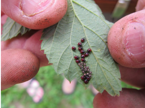
Pests on hops