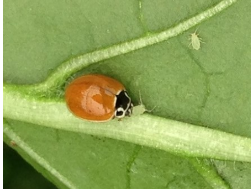
Ladybug on landscape plant