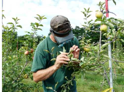
Checking for pests on apples