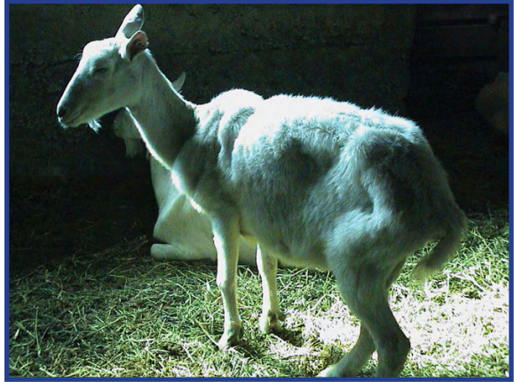
A goat showing symptoms of Johne's disease.

Since the signs of Johne's disease are similar to those for several other diseases—parasitism, dental disease, Caseous Lymphadenitis (CLA) and Caprine Arthritis-Encephalitis Virus (CAEV)—laboratory tests are needed to confirm a diagnosis.