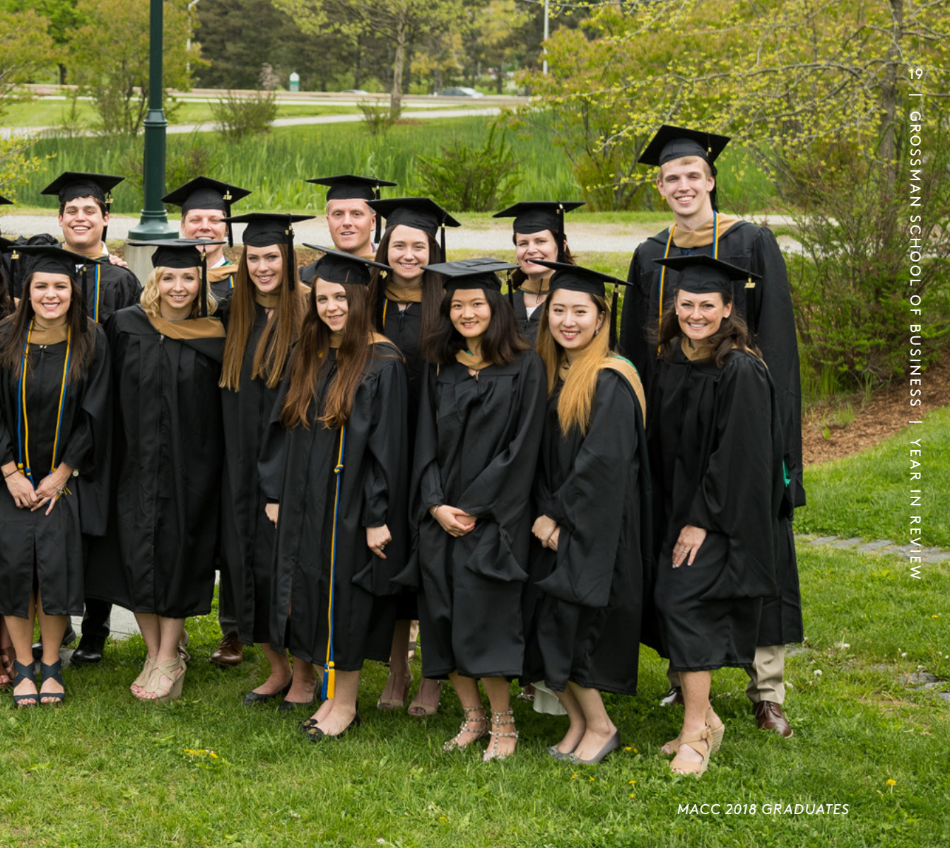
MACC 2018 GRADUATES

#1 “#1 GREEN MBA” IN THE U.S. BY THE PRINCETON REVIEW