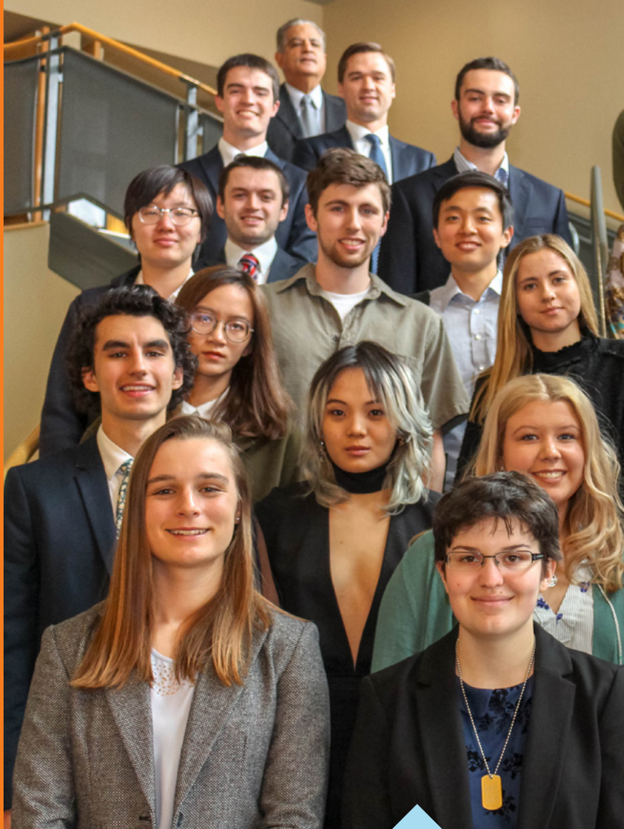
2018 BETA GAMMA SIGMA COHORT