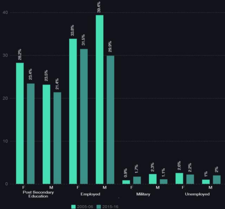
Figure 1: Related Post-Graduate Outcomes