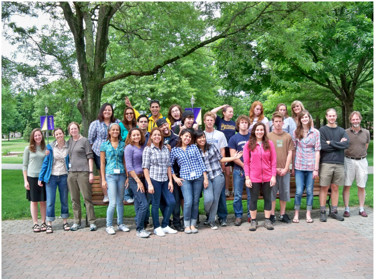
Streams Project Undergraduate Training Week 2010!

As always, Undergraduate Training demonstrated what a great group of young scientists these students are! And, as shown in the group photo below, it is apparent that they are a fun group as well.