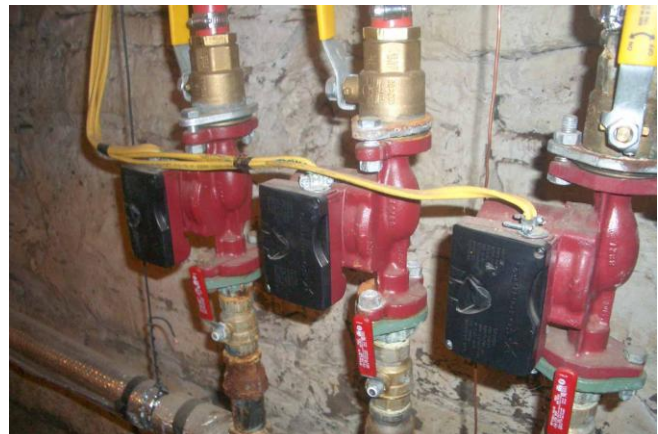
Grundfos multi-speed pumps. The switch on the center left of the black cover allows selection of one of the motor speeds resulting in variation of the flow.