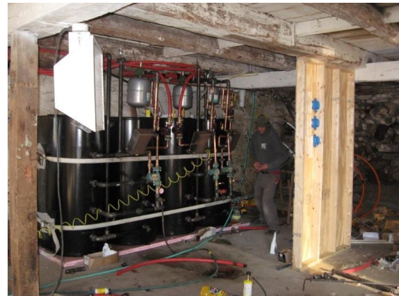
Initial system with tanks

The pressurized, heated water is then delivered to different heating zones through insulated Pex tubing. The diameter of the Pex tubing varies depending on the amount of heating that is needed: 1.25-inch tubing runs to the greenhouses, 1-inch to the residence, and 0.5-inch to the packaging facility.