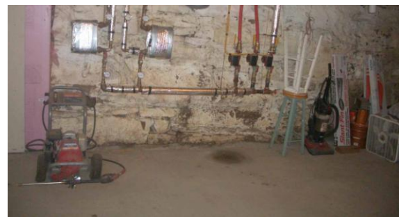
Revised system with tanks replaced by heat exchangers.