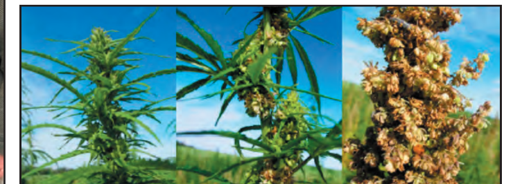
Figure 17. (below): L to R: female plant (not shown), monoecious plant, male plant