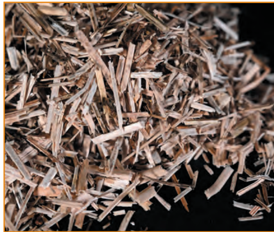
Figure 11. (top): Retted bast fiber. Figure 12. (middle): Retted secondary bast fiber, or tow fiber. Figure 13. (bottom): Hurd fiber.

Dew retting begins as soon as the plants are cut and laid on the ground. In a moist mid-August, dew retting in Vermont takes roughly 16-20 days, but results will vary, as the process is entirely contingent on temperature and moisture.