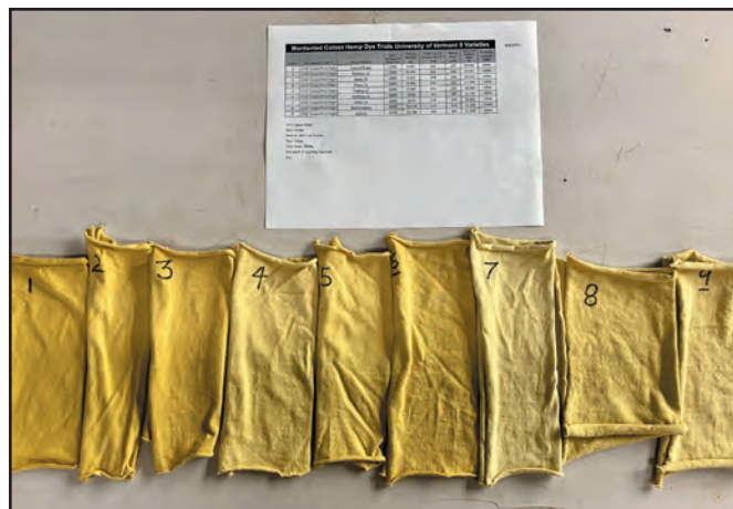
Figure 14. (far left): An antique break used for separating bast and hurd fiber. Figure 15. (left): Botanical Dye made from 9 different varieties of dried hemp leaves.