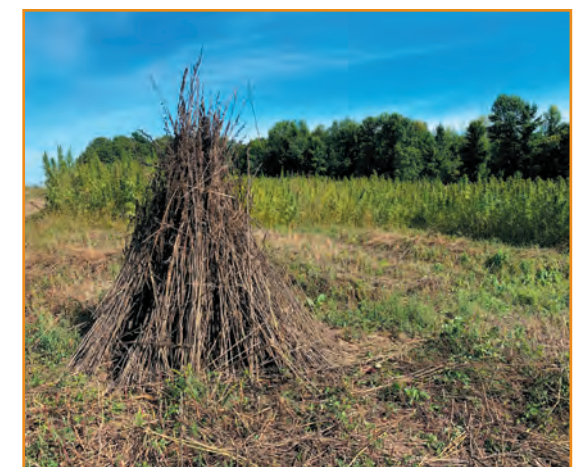
Figure 8. (top): Well-retted hempstalk with bast fiber pulling away from hurd in a 'bowstring' formation. Figure 9. (middle): Fibers field retting by variety. Brown piles in the background have been retting longer than fresh green piles in the foreground. Figure 10. (bottom): Retted fiber drying in a formation called a 'stook'.