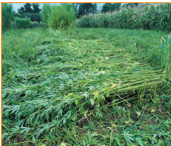
Figure 5. (top): Hemp seedlings a few weeks after planting. Figure 6. (middle): 2023 Fiber hemp trials seen from above. Figure 7. (bottom): Freshly cut Fiber laid to ret with all root-ends and grain heads oriented the same way. Stems should be close enough to touch but with enough space to expose grass in between.

grain production are typically shorter in stature for ease of combining, while fiber varieties grow taller to maximize fiber yield. Some varieties claim both grain and fiber application, and to harvest both off of the same crop is called dual-cropping.