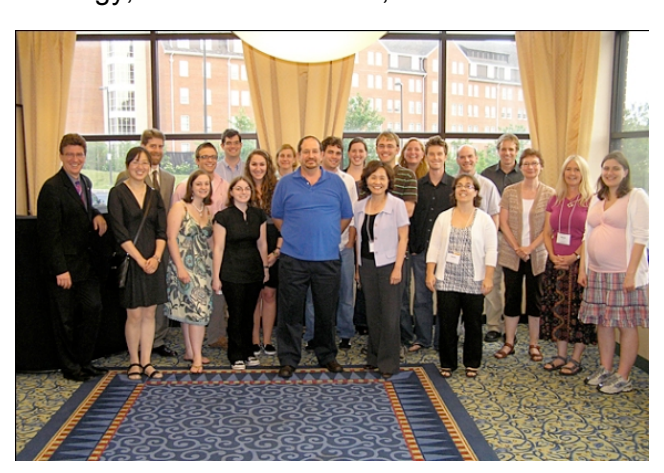
First Little Skate Genome Annotation Workshop, UD, May 2010

The second workshop (Mount Desert Island Biological Laboratory ME, October 2010) included additional lectures on relevant topics, followed by exercises, where the eighteen participants annotated genes from the little skate transcriptome associated with the Wnt and Hedgehog signaling pathways and ABC transporters. With over forty participants, the final workshop (UD, May 2011) built upon the results of the earlier workshops with teams focusing on more complete annotation of genomic and transcriptomic genes from the Hedgehog